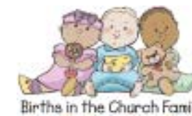
Births in the Church Family

Please make your reservations by noon on Thursday, December 3rd.